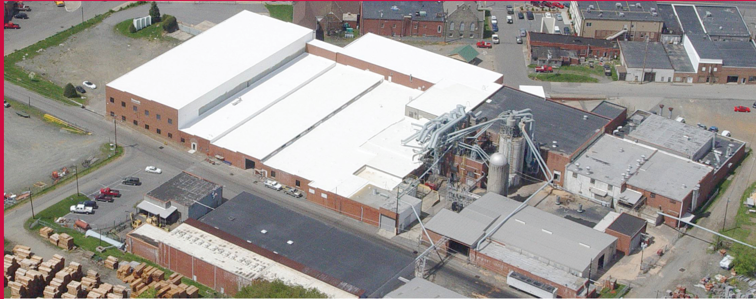
Jefferson Station Retail & Condominium Complex, North Carolina — 85,000 sq. ft.