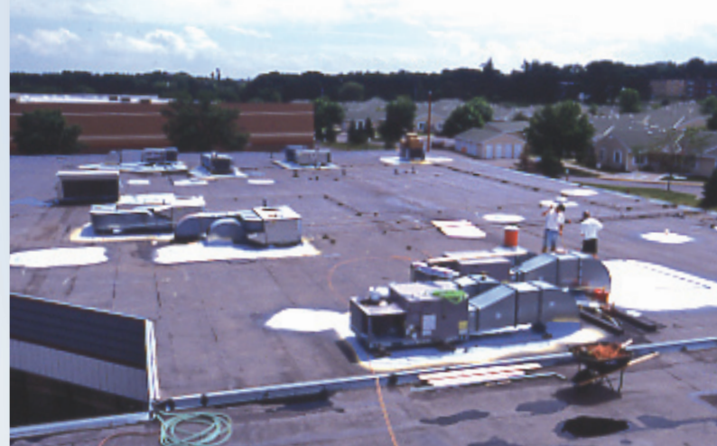
Before foam roofing systems

Seams are one of the major sources of leaks in many roofing systems. Constant expansion and contraction of a building over time exposes these areas to relentless pressure that will eventually open up these seams to cause leaks. SPF systems are totally seamless, eliminating a seam leak from your long list of worries. Taking it a step further, SPF's closed cellular structure does not allow water to travel laterally, unlike other roofing systems.