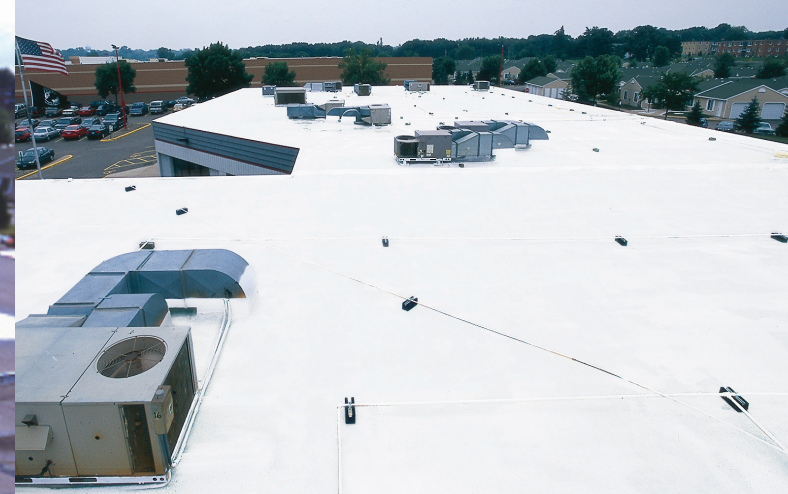
After foam roofing systems